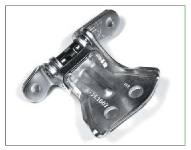
High volume hinge assembly Robotically assembled, incorporating 100% error proofing & functional testing.